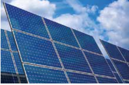
Discover EPower Controller