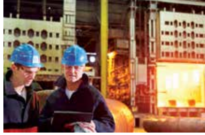
Discover Heat Treatment