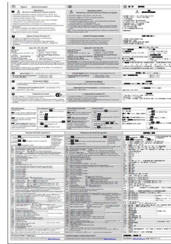
PDF page 3