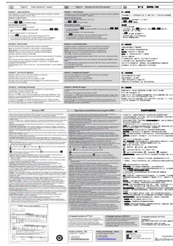
PDF page 2