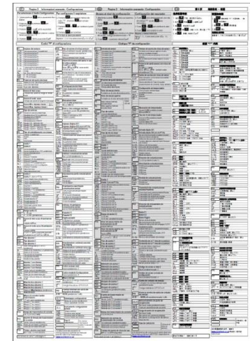
PDF page 4

Note: The images used in these printing instructions are representative only, and may not reflect the actual language variants or precise content